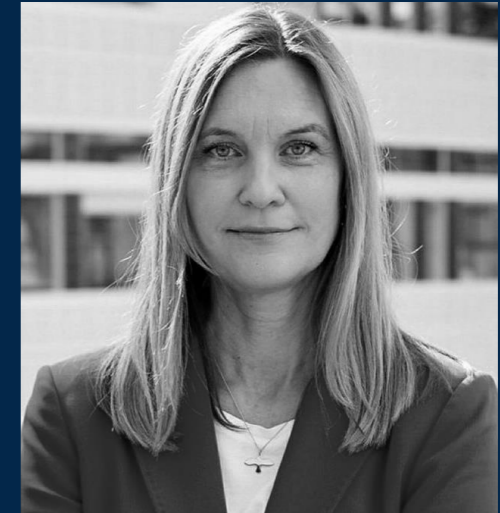
Sofia Hogman, Sweden's Trade and Invest Commissioner to India and South Asia