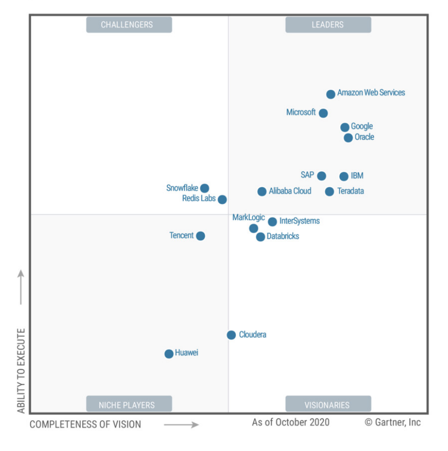
Figure 1: Magic Quadrant for Cloud Database Management Systems

See this complimentary copy of the 2020 Magic Quadrant for Cloud DBMS.